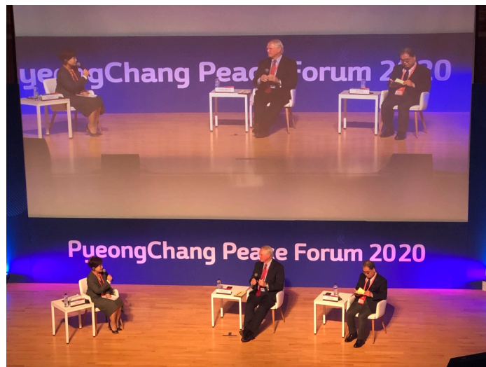
Christopher Hill (middle), former US ambassador to S.Korea, participates in a panel discussion during PyeongChang Peace Forum 2020 Feb. 10. 2020

But this scenario is only after the two Koreas are reunified. For now, Hill holds a firm position that international sanctions must be enforced until the hermit kingdom abandons nuclear weapons.